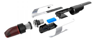
THE MOST INNOVATIVE SUCTION TECHNOLOGY