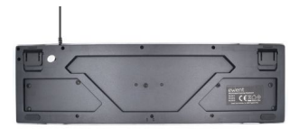
Solid and Reinforced Structure

3 Colour Modes Adjustable Brightness Rainbow Colours Keys & Back Illumination